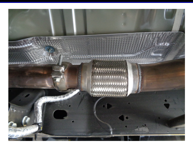
Step 2. To begin, fasten the Inlet pipe assembly to the outlet of the OE system using the OE clamp assembly and by fitting the welded hanger into the rubber insulator (Leave all clamps and fasteners loose for final adjustment of the complete system.)

Step 1. To remove the OEM exhaust system, you will to need to cut the between the muffler and the Y junction where it goes over the axle. You can then disengage the welded hangers from the rubber insulators and remove the tailpipe assy. Unfasten the clamp attaching the OEM inlet pipe assembly to the catalytic converter. Do not damage or discard the inlet pipe clamp or rubber insulators as they will be re-used to mount the new system. Disengage the inlet pipe assembly hanger and remove the exhaust from the vehicle.