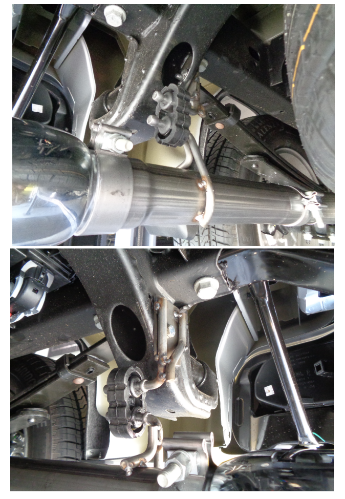
Step 5. As this vehicle was not setup for dual exhaust from the factory, hanger brackets will need to be installed. Install the hanger brackets on the rear frame section using the supplied fastener hardware as shown