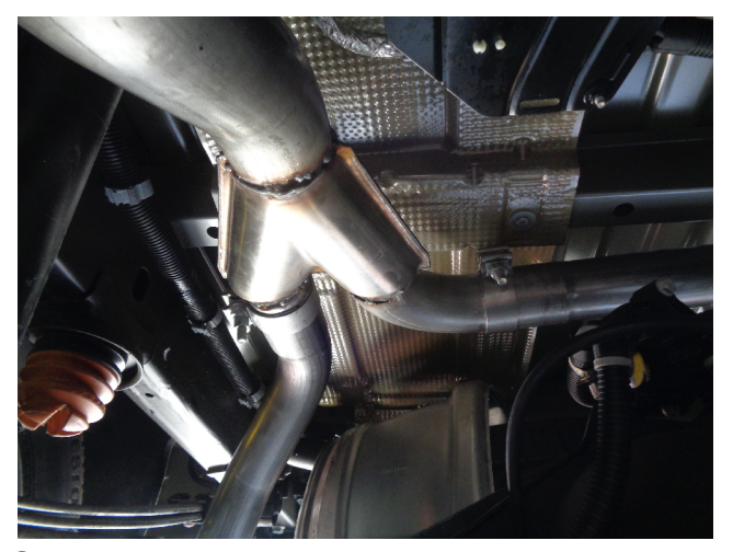
Step 4. Next loosely attach the Driver and Passenger side Extension Pipes to the Muffler Assembly using the supplied 2.50" clamps.